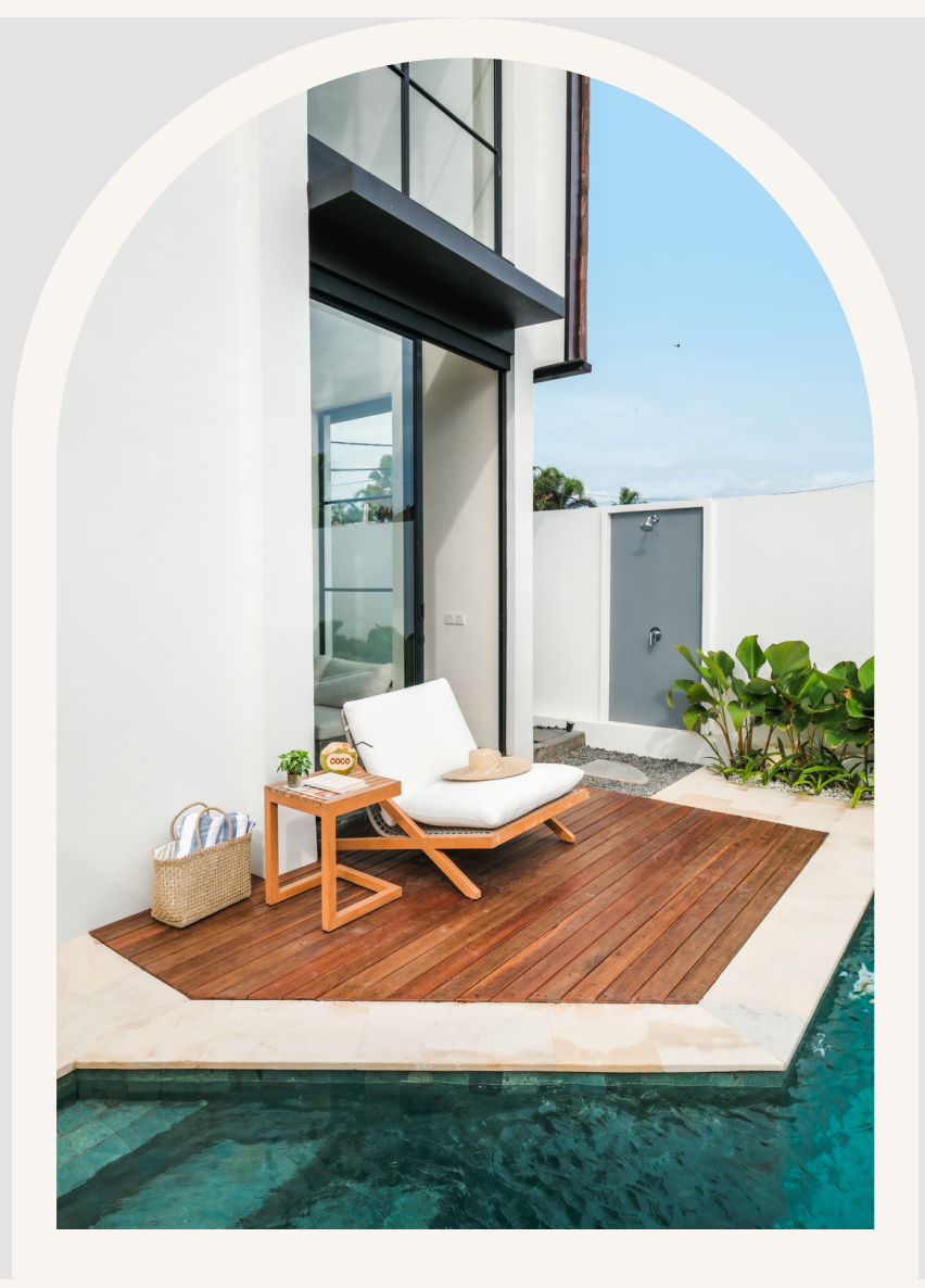
UNVEILING INVESTMENT GEMS IN BALI